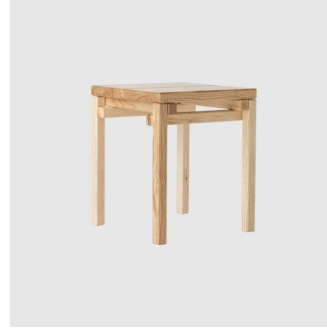
Tim Ber Low STOOL DOWEL JONES