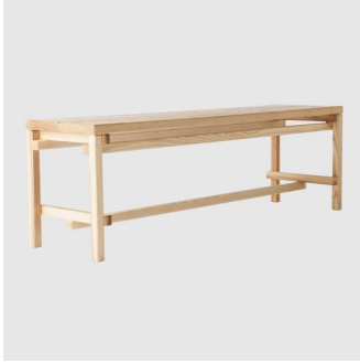
Tim Ber Bench BENCH DOWEL JONES