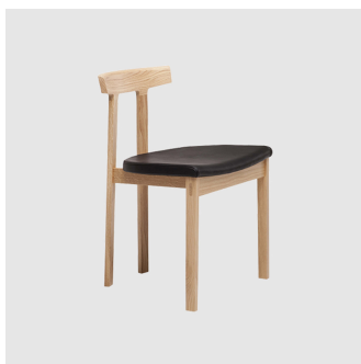
Torii CHAIR BENSEN