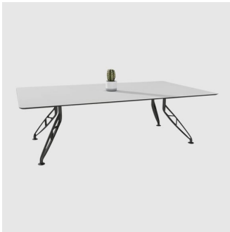
Trapeze Rectangle TABLES THINKING WORKS