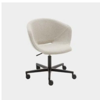
Tusca 5-Way Castor