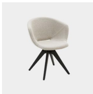
Tusca Timber Trestle