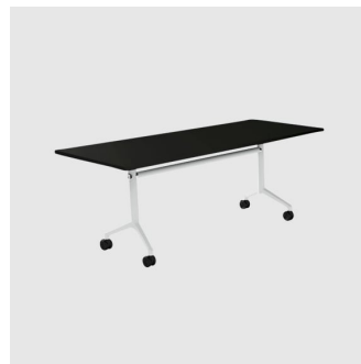
U.R. FOLDING TABLE THINKING WORKS