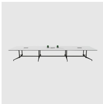
U.R. Rectangle/Boatshape TABLES THINKING WORKS