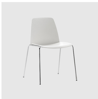
Unnia 4-Leg STACKING CHAIR INCLASS