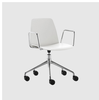
Unnia 5-Way Castor TASK CHAIR INCLASS