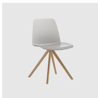
Unnia Timber Trestle CHAIR INCLASS