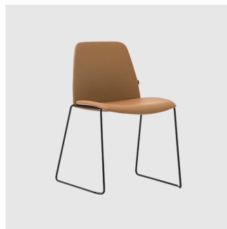
Unnia Sled STACKING CHAIR INCLASS