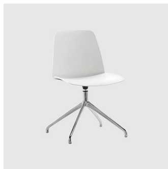
Unnia 4-Way Swivel MEETING CHAIR INCLASS