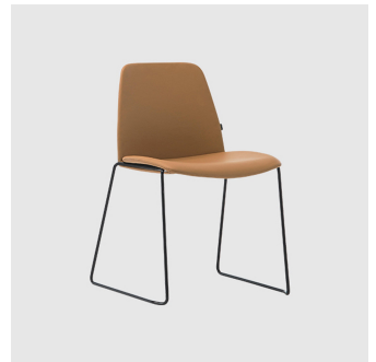
Unnia Sled STACKING CHAIR INCLASS