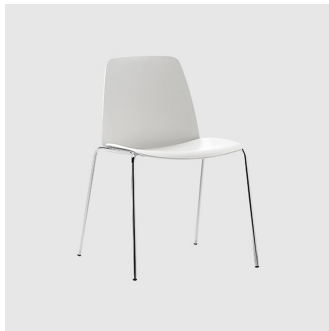
Unnia 4-Leg STACKING CHAIR INCLASS