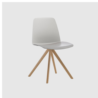
Unnia Timber Trestle CHAIR INCLASS