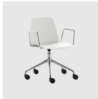
Unnia 5-Way Castor TASK CHAIR INCLASS