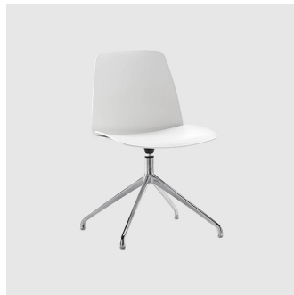
Unnia 4-Way Swivel MEETING CHAIR INCLASS