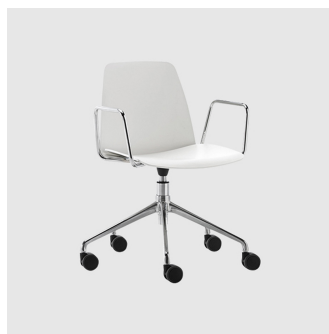
Unnia 5-Way Castor TASK CHAIR INCLASS