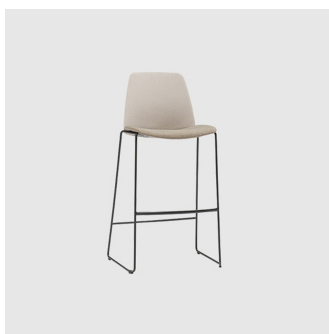
Unnia Sled STOOL INCLASS