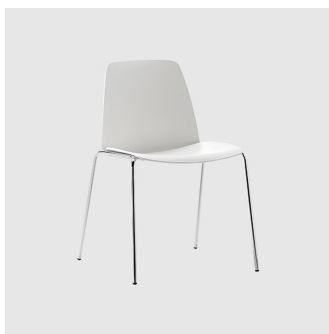
Unnia 4-Leg STACKING CHAIR INCLASS