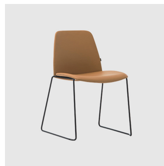
Unnia Sled STACKING CHAIR INCLASS