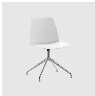
Unnia 4-Way Swivel MEETING CHAIR INCLASS