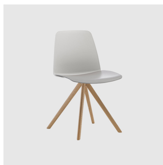
Unnia Timber Trestle CHAIR INCLASS