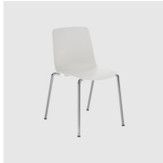
Vesper STACKING ARMCHAIR COLOS