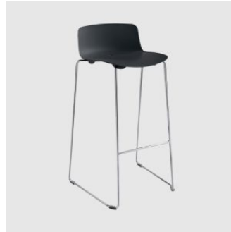
Vesper STOOL COLOS