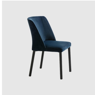
Virginia Timber CHAIR ARRMET