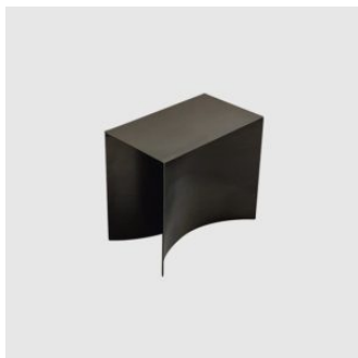
Void STOOL DESALTO