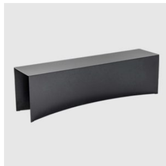
Void BENCH DESALTO