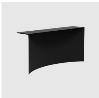
Void CONSOLE TABLE DESALTO