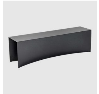
Void BENCH DESALTO