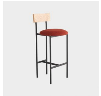
Volta High Chair STOOL DOWEL JONES