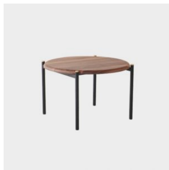
Volta SIDE/COFFEE TABLE DOWEL JONES