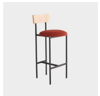
Volta High Chair STOOL DOWEL JONES