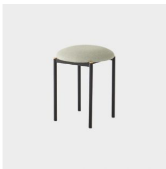
Volta Low STOOL DOWEL JONES