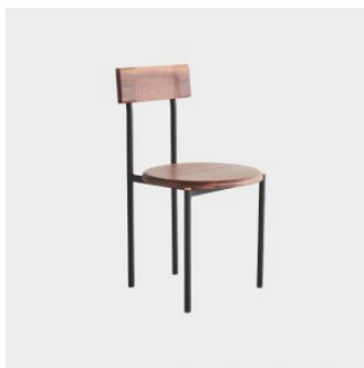
Volta CHAIR DOWEL JONES