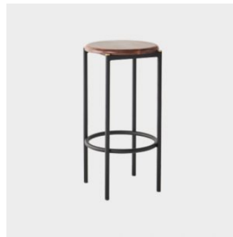
Volta High STOOL DOWEL JONES