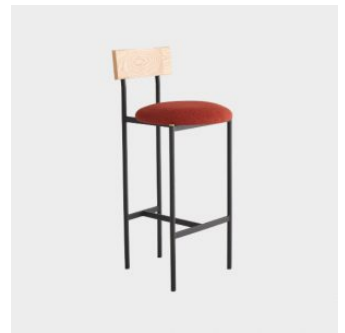
Volta High Chair STOOL DOWEL JONES