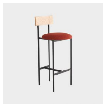
Volta High Chair STOOL DOWEL JONES