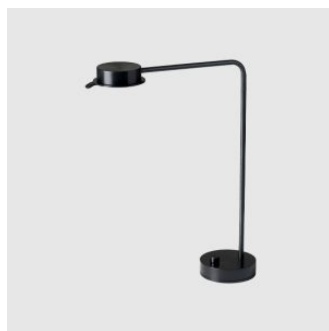
w102 Chipperfield TABLE LAMP WÄSTBERG