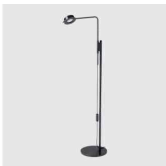
w102 Chipperfield FLOOR LAMP WÄSTBERG