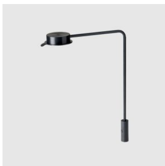
w102 Chipperfield FIXED LAMP WÄSTBERG