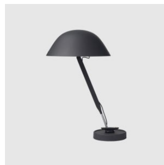
w103 Sempel TABLELAMP WÄSTBERG