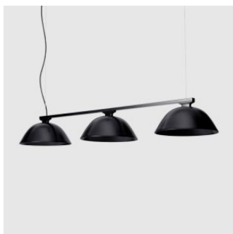
w103 Sempel MULTI PENDANT LIGHT WÄSTBERG