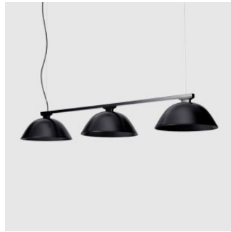
w103 Sempel MULTI PENDANT LIGHT WÄSTBERG