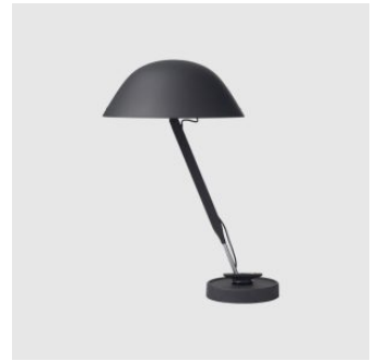
w103 Sempel TABLELAMP WÄSTBERG