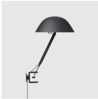
w103 Sempel CLAMPLAMP WÄSTBERG