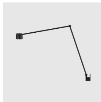
w225 lon WALL LAMP WÄSTBERG