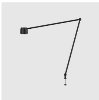
w225 lon FIXED LAMP WÄSTBERG