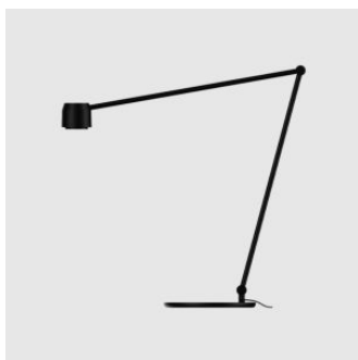
w225 lon TASK LAMP WÄSTBERG