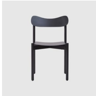
Walk CHAIR REMYINGTONMATTERS