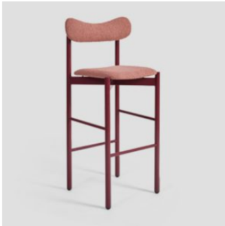
Walk High Chair STOOL REMYINGTONMATTERS