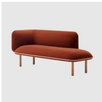
Wes CHAISE LOUNGE SWISS DESIGN