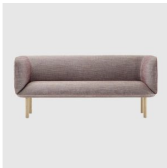
Wes LOUNGE SWISS DESIGN