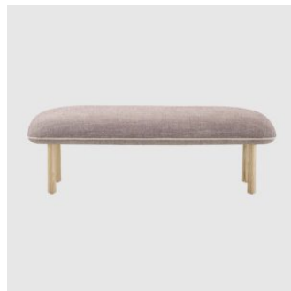
Wes OTTOMAN SWISS DESIGN