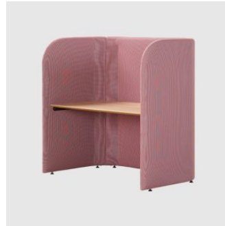
Work With Me (C) WORK POD SWISS DESIGN