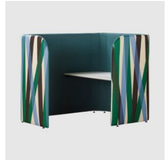
Work With Me WORK POD SWISS DESIGN